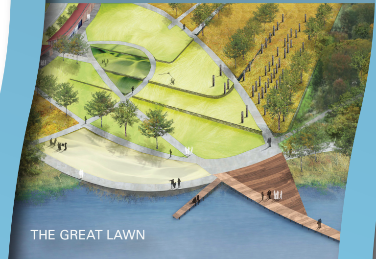
THE GREAT LAWN